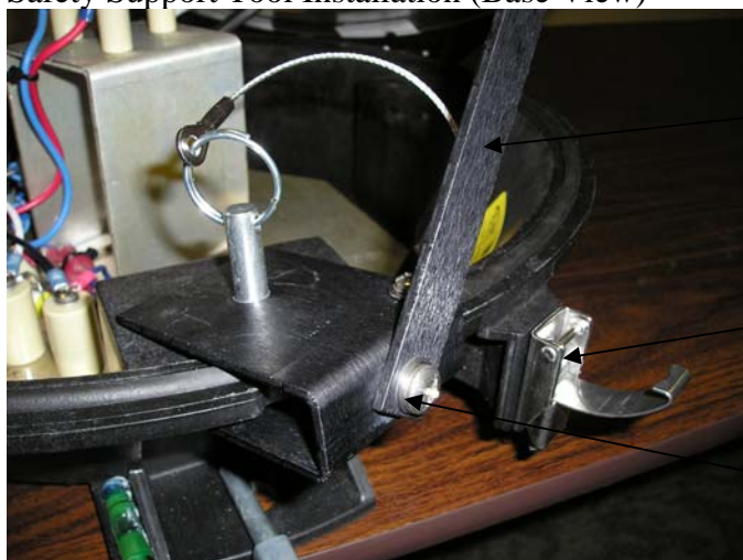
Safety Support Tool Installation (Base View)