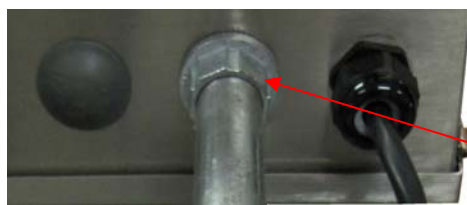
Bottom View of SC 370X Enclosure